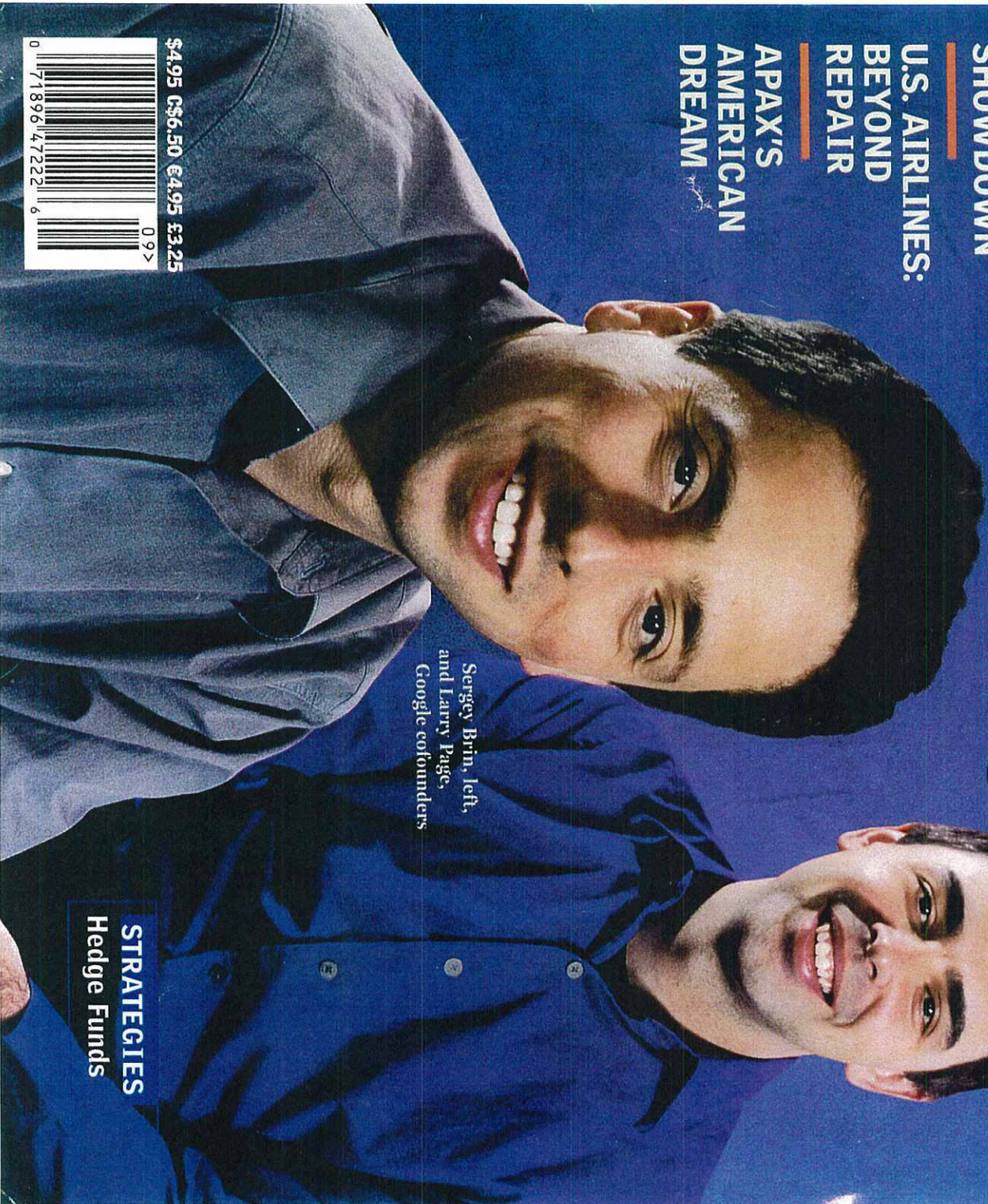
Sergey Brin, left, and Larry Page, Google cofounders